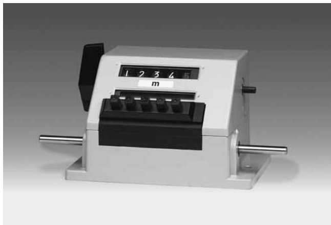
ME280 - Meter counter