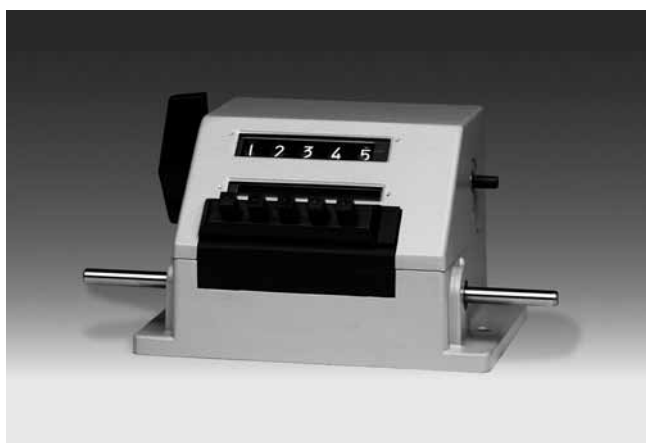
UE280 - Revolution counter