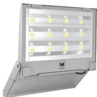
GUELL 4 A/W