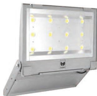
GUELL 4 S/W