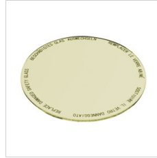
8435963 Food glass filters for fruits and cheese