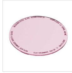
8435961 Food glass filter for meat products