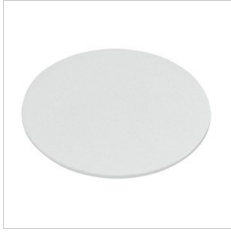
8417900 Frosted safety glass pane