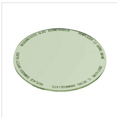
8435964 Food glass filter for vegetables