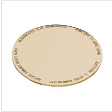
8435962 Food glass filter for bakery products