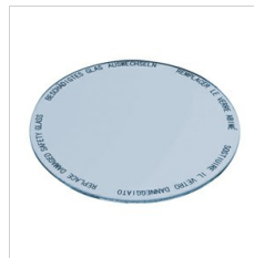
8435965 Food glass filter for fish products