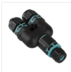
310496 Connection Kit Y 3-way D.7-10.5mm IP68