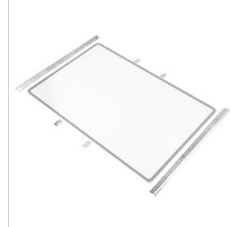
14474494 Protective glass SQUARE PRO (max 840 W)