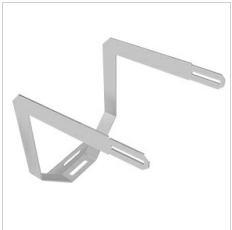
14474594 Vertical bracket SQUARE PRO