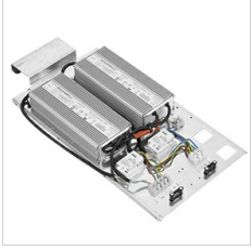
14473401 Drivers unit 600 W - 1,4 A - 2CH - 220- 240 V 50/60 Hz