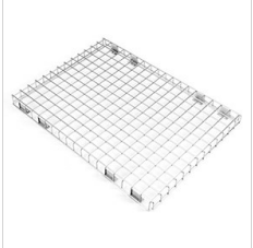
14474201 Protective grid SQUARE PRO