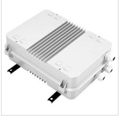
14473994 Drivers box 600 W 1,4A-2CH-DIM DALI