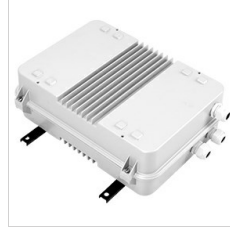
14473894 Drivers box 600 W - 1,4 A - 2CH - 220- 240 V 50/60 Hz