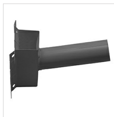
14077796 Hot-dipped galvanized wall angled steel bracket, cataphoresis and polyester powder